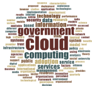
Figure 2. The results of the Nvivo 12 plus analysis using the word cloud feature (2022)

The picture above is the result of a search article on adopting cloud computing systems in e-Tourism and has been analyzed using Nvivo 12 plus, resulting in several driving factors, namely infrastructure, technology, citizen service, benefits, digital support, and high access.