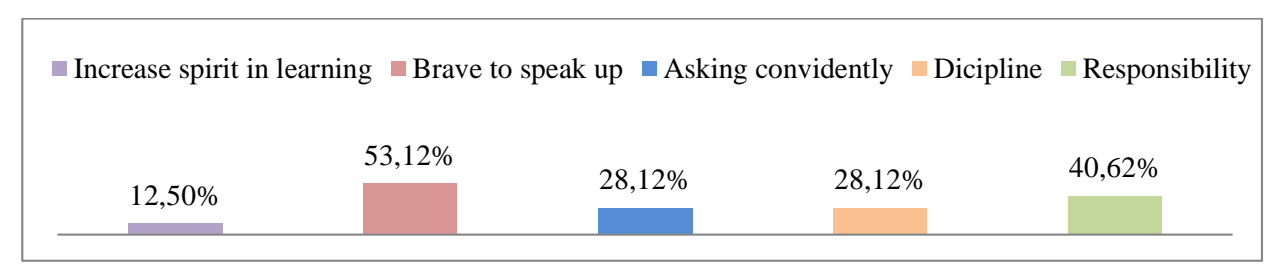
Chart 2. Students' score of the impacts from E-learning use

Learning using E-learning gives influence to students. The impact obtained by students from learning to use E-learning could be divided into two sides; there was a good impact and bad impact. These good impacts, for example, increase student enthusiasm for learning, increase courage in expressing opinions in forums, increase confidence in asking questions, increase time discipline, and increase the sense of responsibility. The explanation above was following Zhang's statement (in Ghavifekr & Rosdy, 2015), E-learning could improve students' confidence in communicating and expressing opinions or ideas. E-learning has an effect in the form of increasing discipline and responsibility following the statement of Tavangarian (in Zhao, 2011: 68), which states that students must have high motivation and sense of responsibility in learning E-learning. It is because several tasks were collected with limited time, so discipline was needed in this case.