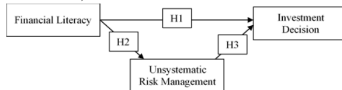
Figure 1. Research Model

H3: There is a significant influence of unsystematic risk management on investment decision. (Figure 1 research model). From the previous explanation, which explains the relationship between variables, namely, financial literacy can affect investment intentions, Financial Literacy can affect unsystematic risk management, and unsystematic risk management can affect investment intentions, the research flow can be described as follows.