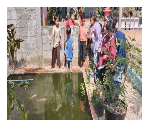
Figure 6. animal husbandry activities at the natural preschool in Bulukerto

Activities introducing animal husbandry to early childhood in nature-based schools can yield numerous benefits and positive outcomes. The following are some of the potential results that may be achieved from this activity: (1) Understanding animals and their life cycles, (2) through introductory farming activities, children can develop an understanding of various types of livestock and their life cycles, (3) they can learn how animals develop from eggs or babies to adulthood. This understanding helps them recognize the natural processes in animal life and appreciate the wonders of nature. (4) A sense of responsibility towards animals makes children empathetic and fosters a preference or love for animals.