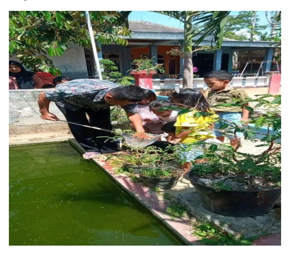
Figure 5. animal husbandry activities at the natural preschool in Bulukerto

animals, too, require love and care (Susmiyati, 2014). Introducing animal husbandry to early childhood in nature-based schools serves as an engaging approach to acquaint children with the world of animal husbandry.