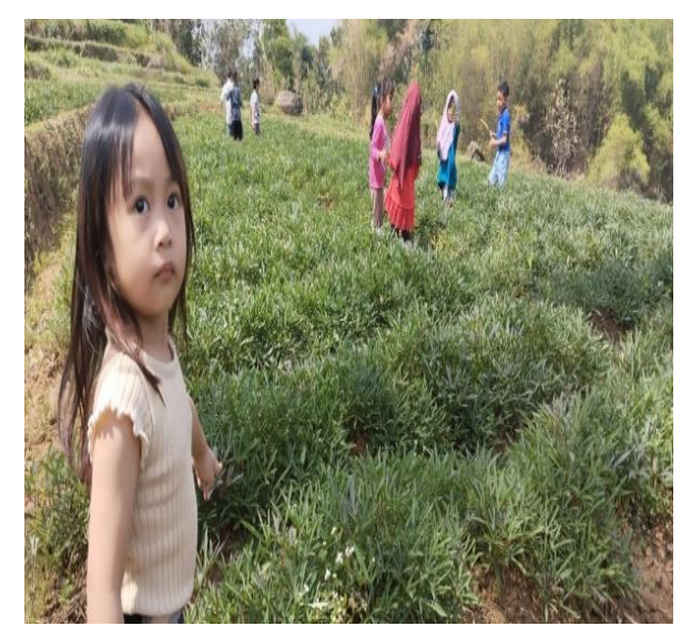
Figure 2. Nature Walk in KB Alam Bulukerto

Nature Walks in early childhood at nature-based schools can exhibit significant variation depending on factors such as the chosen approach, the duration of the activity, and the level of children's participation. Potential outcomes of these activities include: (1) fostering a deeper understanding of nature and the surrounding environment, (2) learning about various plant types, animals, and ecosystems, (3) comprehending the interconnectedness between humans, animals, and the natural environment, (4) raising awareness about the importance of environmental protection, and (5) becoming acquainted with environmental issues like recycling, water conservation, and biodiversity preservation. These experiences have the potential to inspire children to develop a caring and responsible attitude towards the environment.