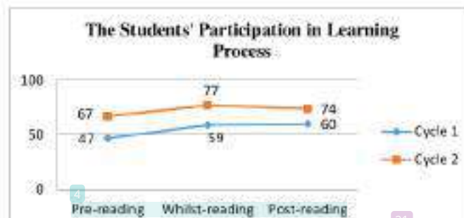
Figure 2. The Percentage of the Learners' Engagement in Teaching and Learning Process

Besides, it was also observed the students' involvement or participation during the implementation of the Story Mapping Strategy. Based on the findings, the student's participation in employing Story Mapping Strategy had significantly improved. The percentage of the students' involvement in operating the strategy in Cycle 1 and Cycle 2 is presented in figure 3.