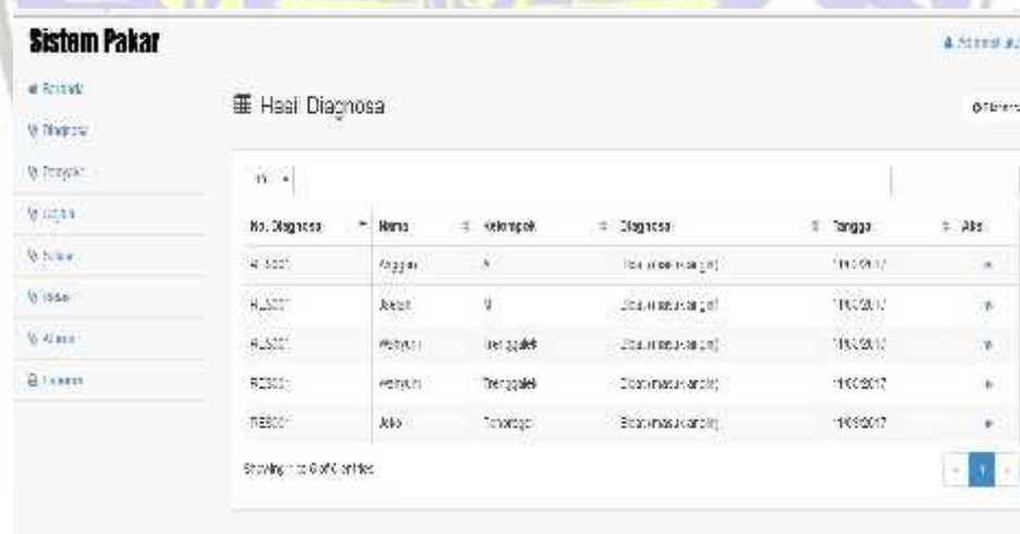
Gambar 4.10 Menu Halaman Data Diagnosa

Menu ini berisi tentang data diagnose penyakit kambing pada menu ini admin dapat menambah, menghapus dan mengedit data diagnosa penyakit kambing.