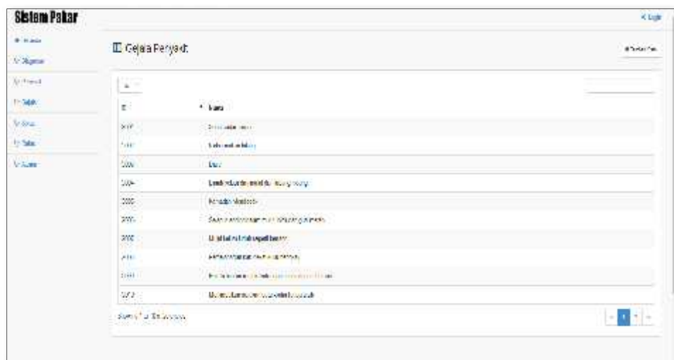
Gambar 4.4 Menu Gejala