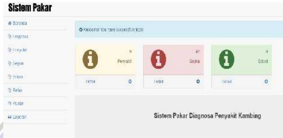
Gambar 4.7 Menu Utama Admin

Menu ini hanya dapat diakses oleh admin yang telah berhasil melakukan logindengan memasukkan username dan password dengan benar.