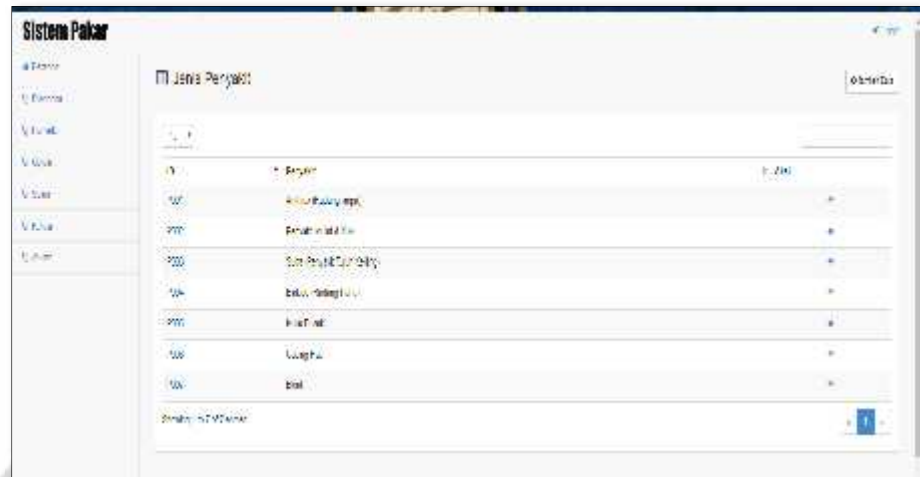
Gambar 4.3 Halaman Penyakit

Pada menu ini berisi informasi data penyakit pada kambing. Tampilan halamannya seperti gambar berikut ini