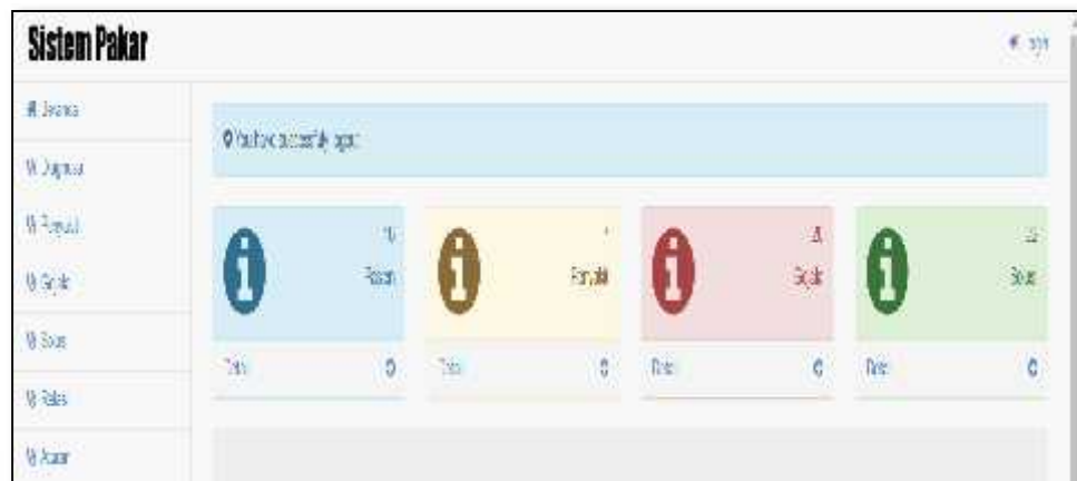
Gambar 4.1 Halaman Utama