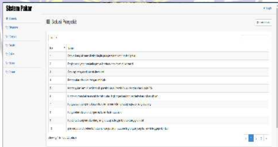
Gambar 4.5 Menu Solusi

Pada halaman ini berisi tentang informasi solusi untuk penyakit yang menyerang kambing.