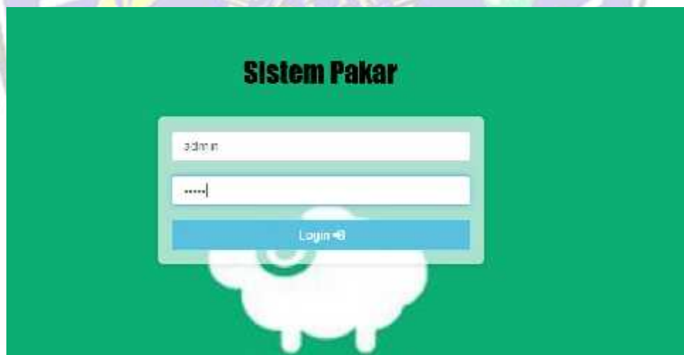
Gambar 4.6 Menu Login Admin

Menu ini dibuat khusus untuk administrator tidak untuk umum, dengan menu ini administrator dapat memasukkan data yang dibutuhkan dalam aplikasi tersebut.