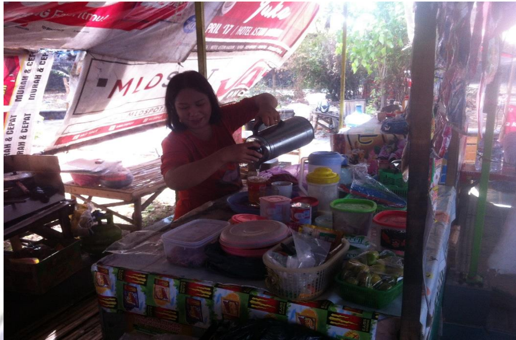
Pedagang Pramu Jaya menyiapkan minuman untuk pelanggan