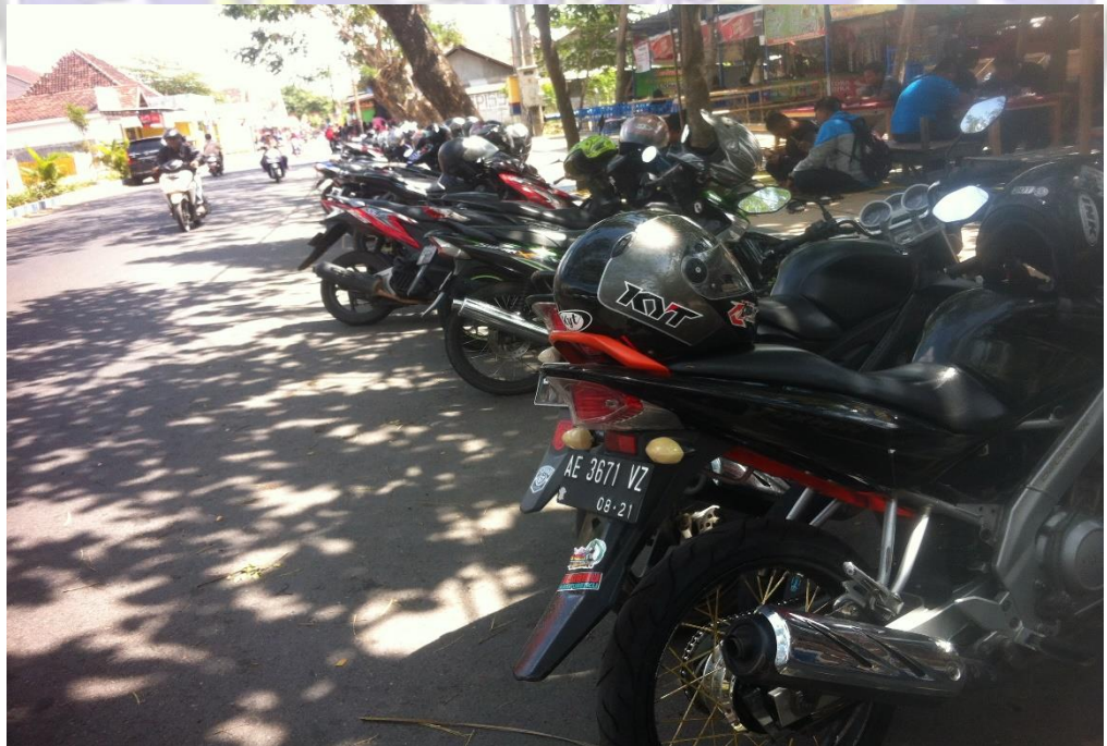
Pengendara masih memarkir kendaraan mereka dibahu jalan