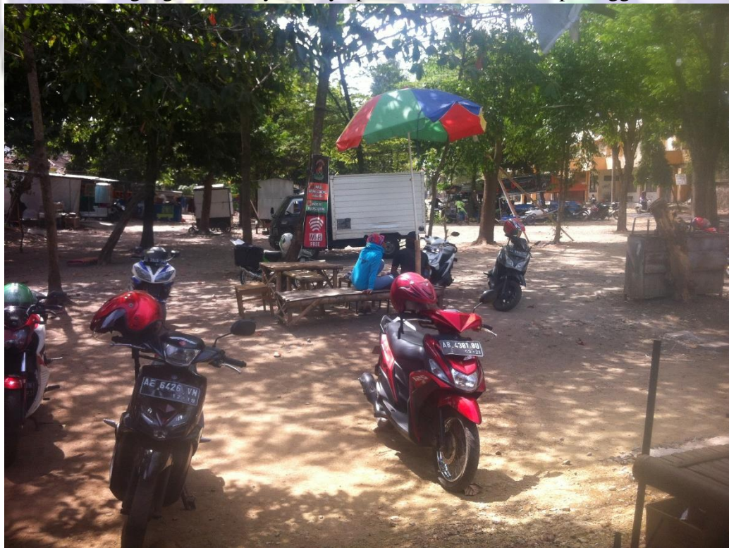
Lahan kosong utara Pramu Jaya