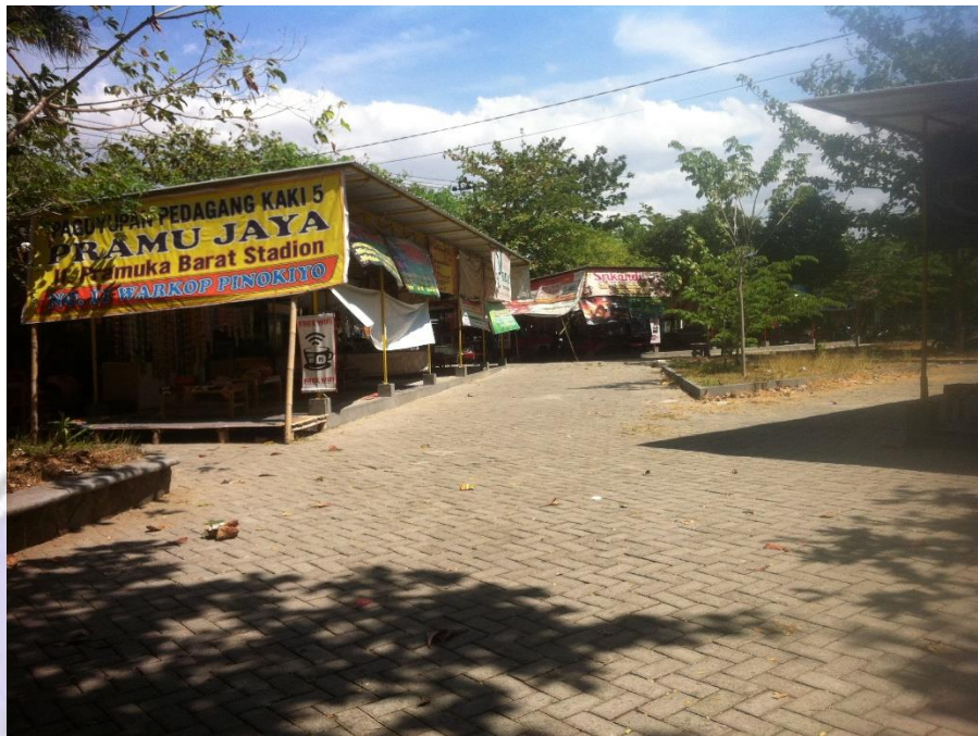
.Lokasi Pramujaya dari terlihat dari pintu masuk