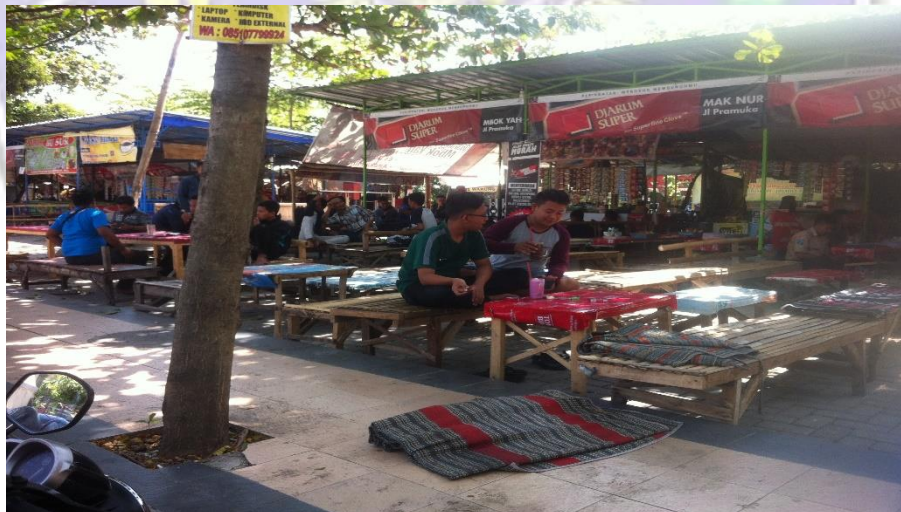
Pelanggan saat menikmati hidangan