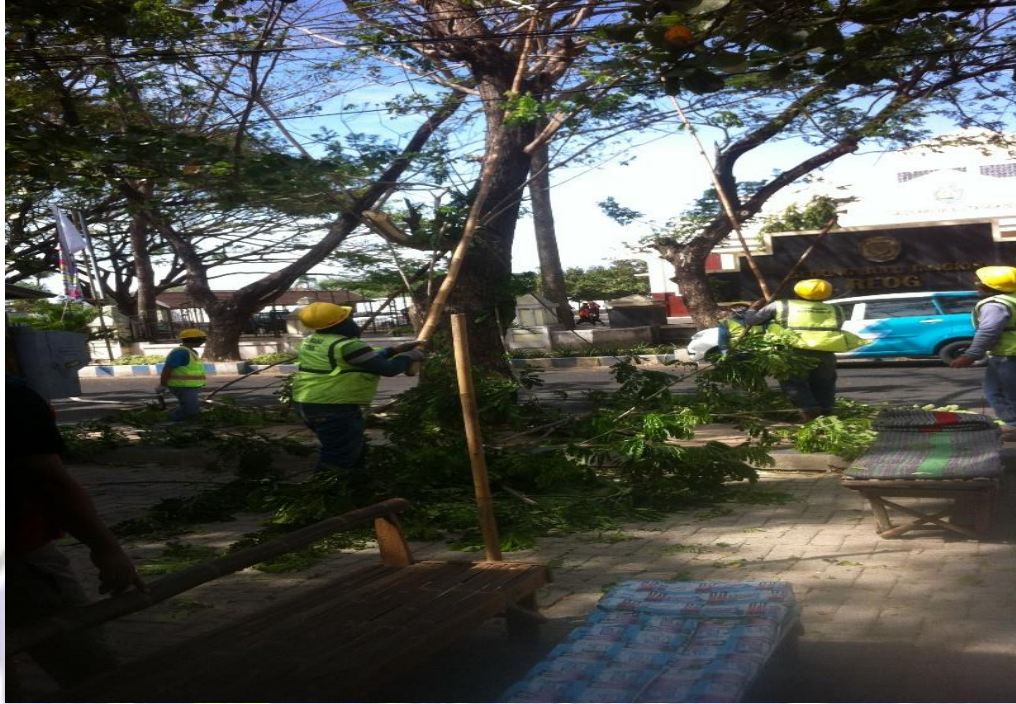
Pemeliharaan kawasan Pramu Jaya oleh pemerintah