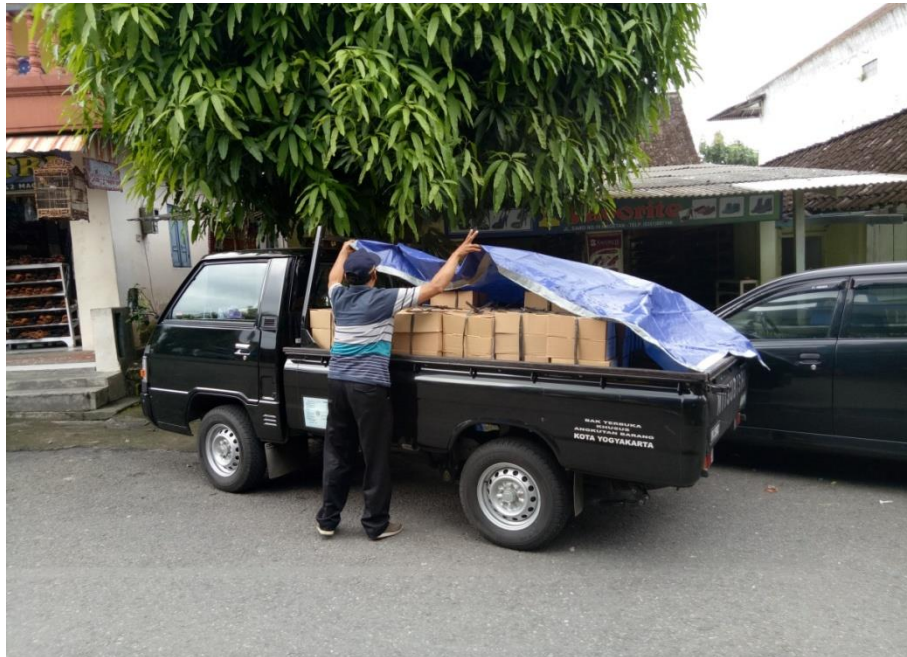
Proses pengiriman barang