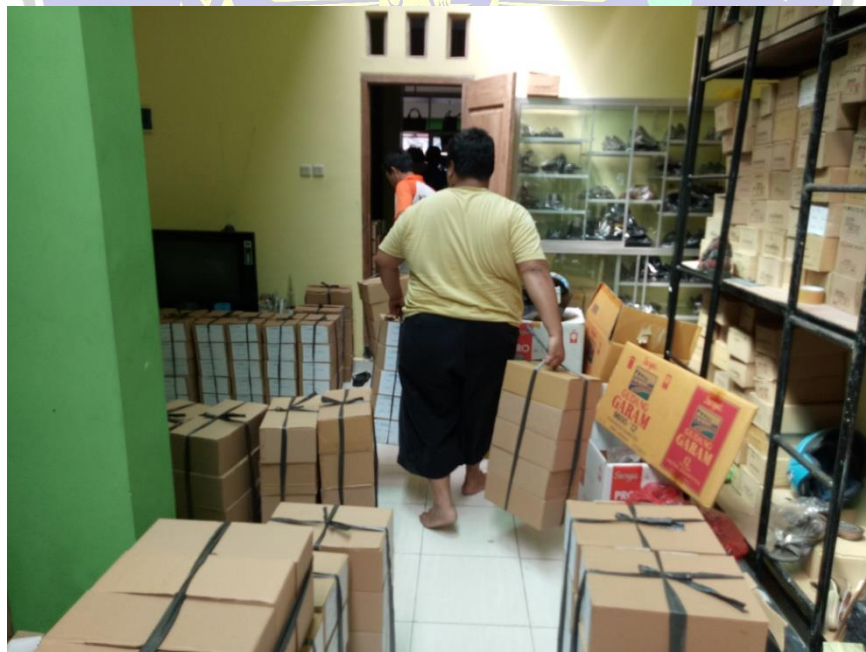
Sepatu yang akan dikirim ke luar kota