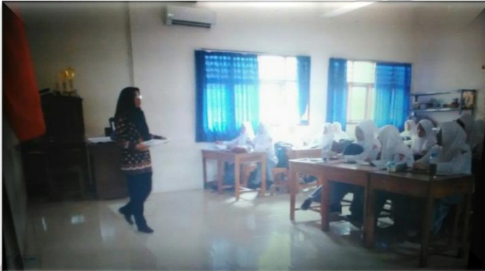
Observation Teacher B at class XII IPS 1