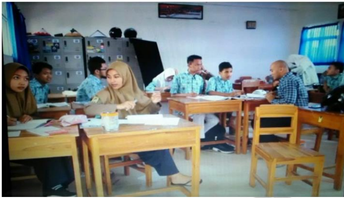
Observation Teacher A at class XI MIPA 3