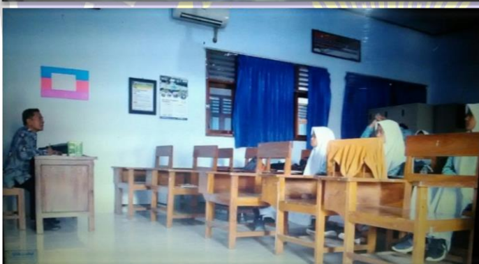
Observation Teacher C at class X MIPA 2