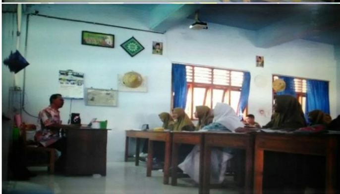
Observation Teacher D at class XI MIPA 4