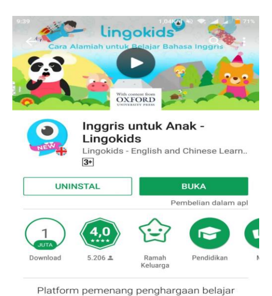
bahasa Inggris prasekolah (2-8 tahun) Picture 1. 'Lingokids' in Playstore

'Lingokids' has become one of the applications of favorite educational genre and obtained a good rating on the playstore. This demonstrates the enthusiasm of the community in using this application. Children are very natural learners. They can search for and absorb all knowledge gained from wherever, whenever and wherever.