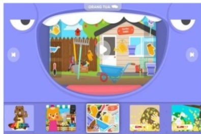
Picture 2. The Initial View of 'Lingokids'

A 'user-friendly' initial view can be seen from this application. There is even a special menu of parents who make this application more complete.