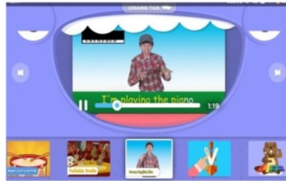
Picture 3. Video view in 'Lingokids'

The application also offers several menus such as, learning english with audio, learning animal pictures and plants, and equipped with video songs that can be played at any time. This makes it easier for us to guide children as they learn.