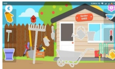
Picture 4. The Games of Introducing Household Chores.

In addition to offering several menus above, the author also found the ease of accessing the menu that when children try to play these games they will easily shuffle items in the games, such as in the introduction of tools which is behind the house. This game provides images of forks, hoes, gloves and other tools.