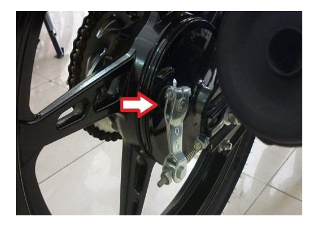
Figure 1. Braking system

Methods used to determine the occurrence of failured component are macro and micro observation, chemical composition, and testing of mechanical properties (7). Failure analysis of braking panel system of motorcycle are presented. Figure 1 shows the brake system component of a motorcycle. Brake panel/backplate is a failured component. This component has been repaired. After used in 3 months, the brake panel is fractured during braking process. From the result of the observation using digital camera, the obtained shape and fracture location as shown in Figure 2.