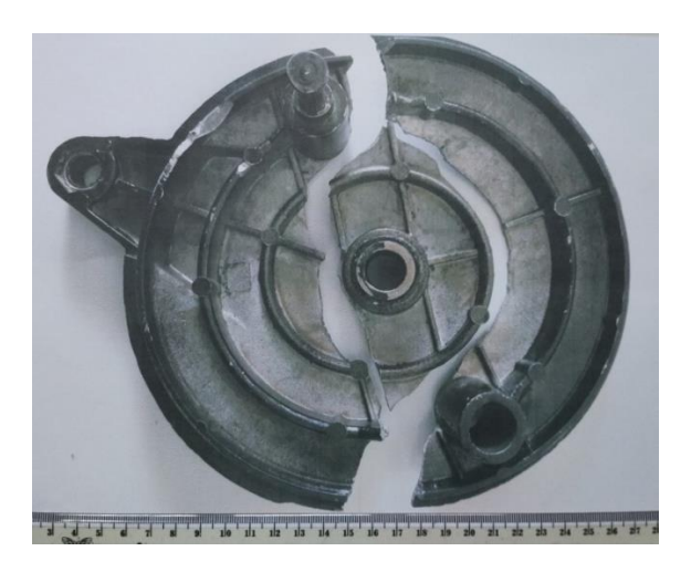
Figure 2. Broken component