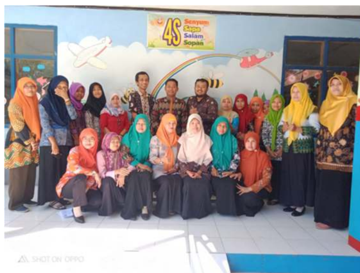
Figure 5 Photo session after workshop

One example of multimedia-based learning media made by participant with utilizing Microsoft PowerPoint can show in Figure 4.