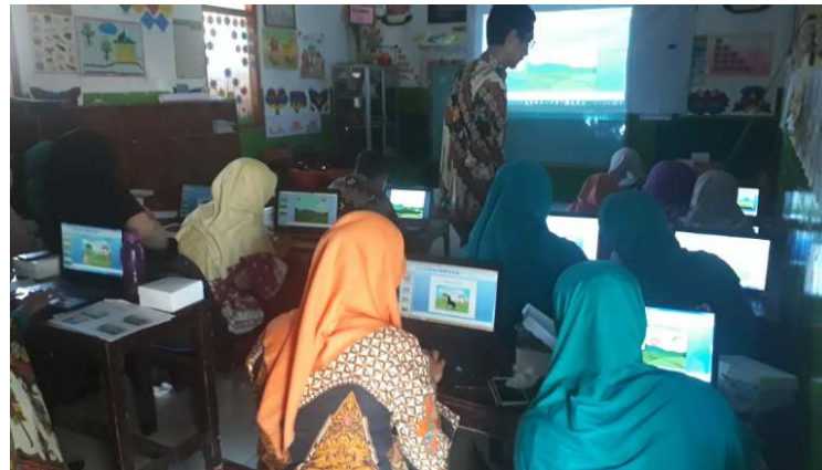
Figure 2 Lecturer team was explain the material

Of all participants in this workshop, 98% of teachers have been able to create learning media by utilizing Microsoft PowerPoint. But some teachers are still cannot make learning media by utilizing Microsoft PowerPoint. After the workshop we have planned to conduct monitoring and mentoring for teachers who were present at the workshop, who have can't create the learning media very well. The Figure 2 had shown the participants following the workshop seriously.