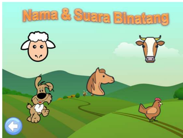
Figure 4 Examples of learning media made by participants

One example of multimedia-based learning media made by participant with utilizing Microsoft PowerPoint can show in Figure 4.