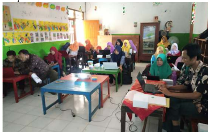
Figure 3 The Lecturer Team is accompanying the participants

One of the Lecturer Teams was assigned to explain material during the training. And other from was in charge of directly accompanying the participants. So the participants could understand well the theory and practice in creating multimedia-based learning media. The Figure 3 had shown the lecturer team is accompanying the participants