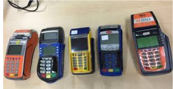
Figure 1 EDC machine

The use of EDC and personal agents by sharia banks to increase actual transactions is in line with Branchless Banking policies launched by Bank Indonesia. It is done to improve banking services beyond the conventional form of banks in order to serve unbankable people who are not served for some reason by the Bank.