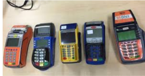
Figure 1 EDC machine

The use of EDC and personal agents by sharia banks to increase actual transactions is in line with Branchless Banking policies launched by Bank Indonesia. It is done to improve banking services beyond the conventional form of banks in order to serve unbankable people who are not served for some reason by the Bank.